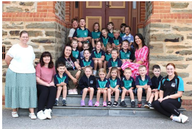
1 - Our 2024 Receptions

We would like to welcome our 2024 Receptions and Families to our school community.